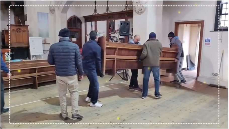
Church Pews leaving our Church for their new destination - St James Mar Thoma