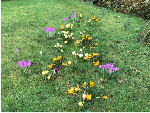
Jean's new garden